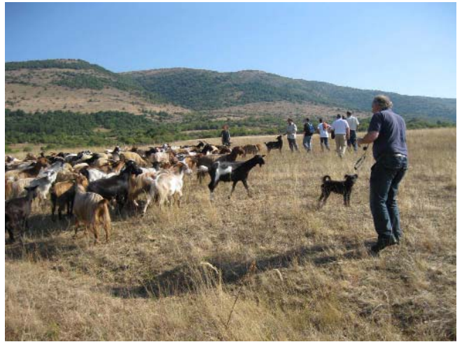
herd of goats

and 51 moss species or 34 % of the nationally identified plant species. Until World War II a big proportion of the park landscape was shaped by grazing practices of local and nomadic tribes, breeding more than 300,000 sheep (Pirot Zackel and Karakachan Sheep).