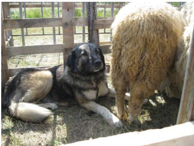
shepherd dogs to protect against bears and wolves