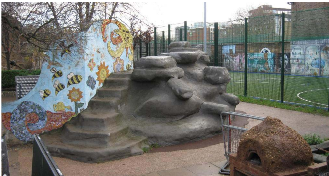
5-a side pitch, climbing 'risk' structure, clay oven

During opening hours there are opportunities for children to carry out art work such as painting, drawing, cutting and pasting or Playdoh. There are also puzzles, games, musical instruments and a variety of creative toys. There is a home play corner with dressing-up clothes for role play. There are also toys and facilities for babies. For families there are regular recreational and educational trips which could include trips to the seaside, theatre, and National parks etc. The Under 5's drop-in enables families and carers of children under 5 to meet and interact while their children learn through play.