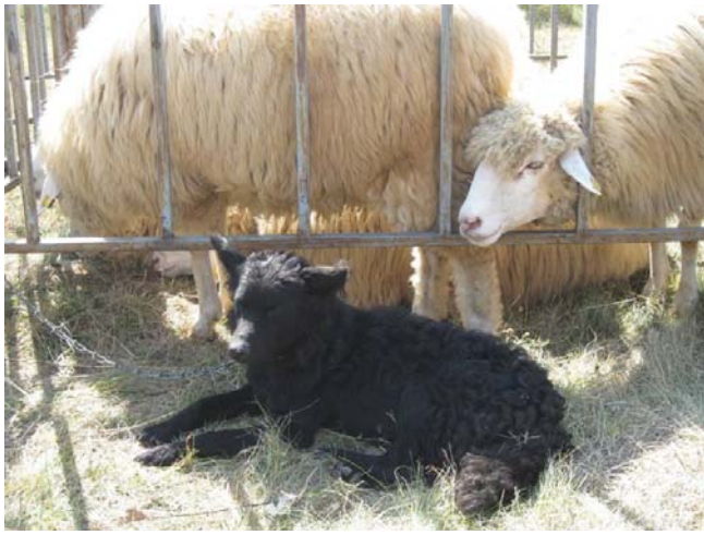
Shepherd dogs to herd