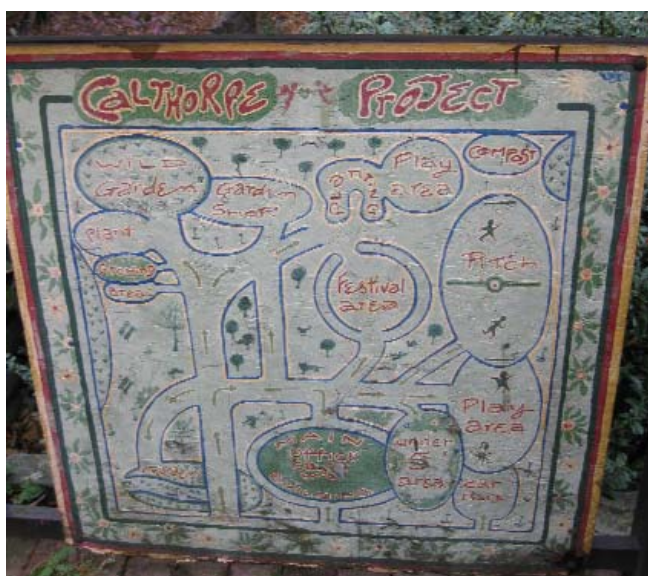
Map Calthorp project