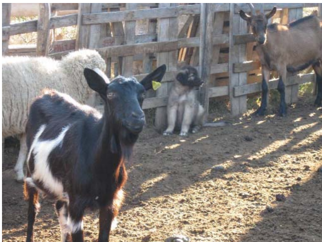
starting to associate with sheep and goats at an early age...

The Stara Planina Nature Park ( 1.114 km 2 ) was established in 1997 as the biggest Serbian protected territory. It was proclaimed as a Peace Park between Serbia and Bulgaria in 1996. The park is one of the richest plant areas of Serbia, with about 1,190 plant